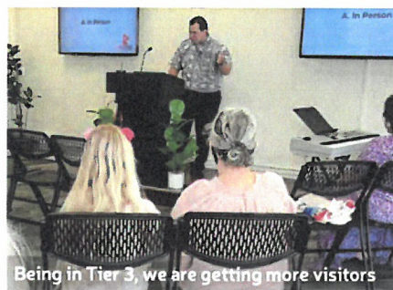
Being in Tier 3, we are getting more visitors